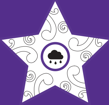
Waipuna-ā-rangi/ Electra (W)