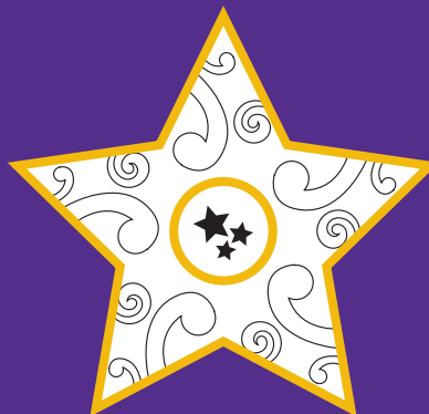
Hiwa-i-te-rangi/ Calaeno (W)